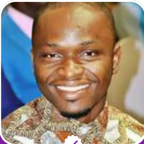
HON. COLLINS F. TAMBA

Assistant Minister for TVET/STEM Ministry of Education Republic of Liberia