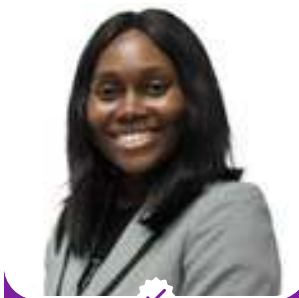
ATTY. LAURA GOLAKEH

Deputy Minister for Administration Ministry of Gender, Children, and Social Protection, Republic of Liberia