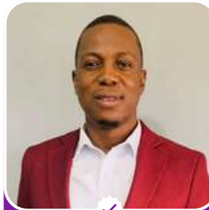
HON. ALPHANSO PAYE KORTO, SR.

Deputy Minister for Gender Ministry of Gender, Children and Social Protection, Republic of Liberia